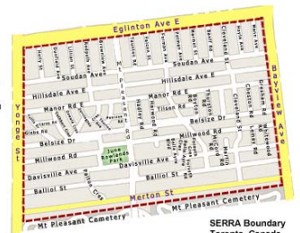
SERRA Boundary Toronto, Canada SERRA is bounded on the North by and including the south side of Eglinton Ave East; on the South by and including the south side of Merton St; on the East by and including the west side of Bayview Ave; and on the West by and including the east side of Yonge St.

The new website, though based on the original site, will have much more up to date information, more links to other groups and there will also be interactive areas on the site for your participation in the coming months. You will appreciate that this is a work in progress so it is very important that we get your feedback with ideas or suggestions that you might have to further improve the site and the profile of the Association.